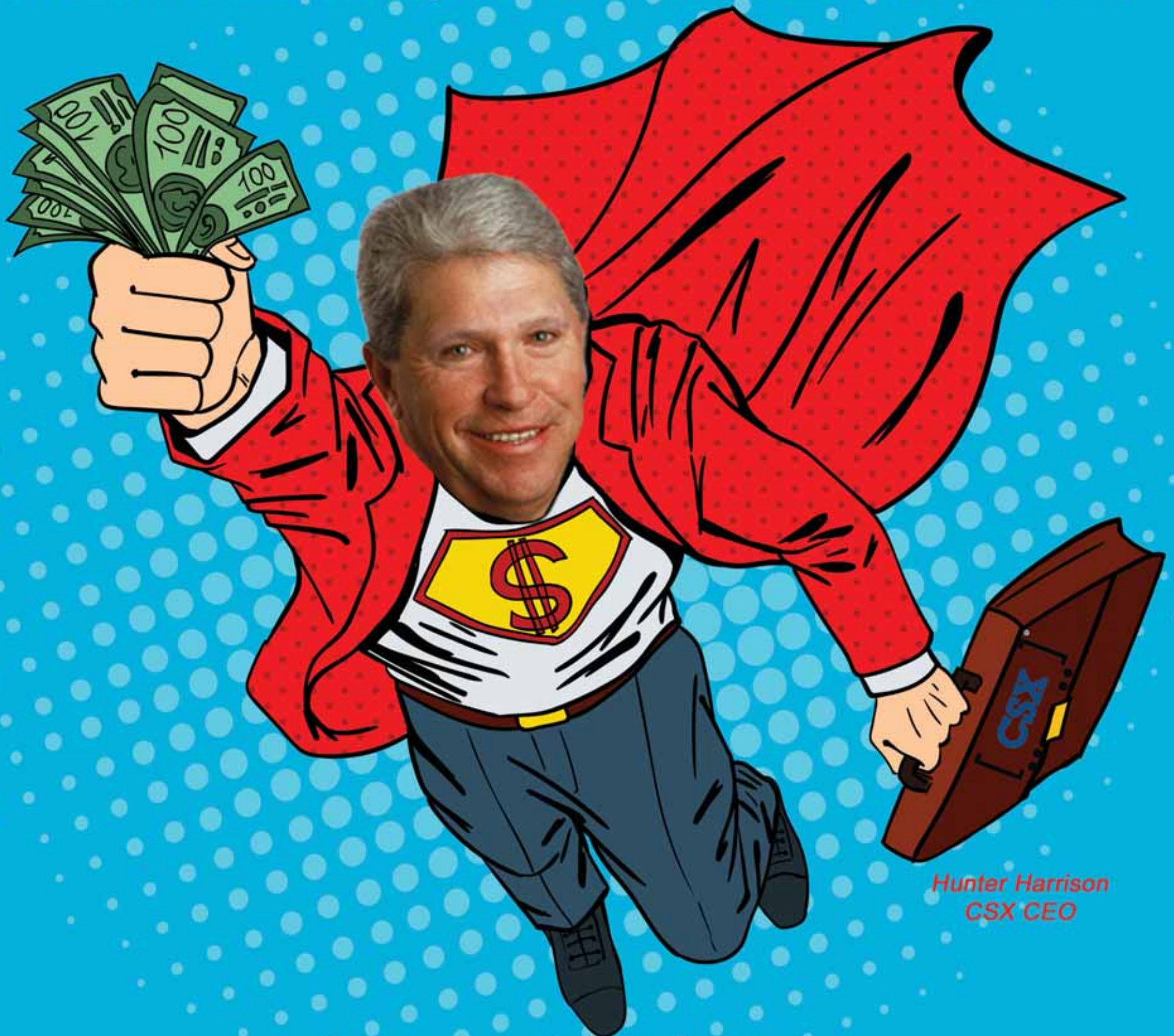
Hunter Harrison CSX CEO

The Infant of Greed is now the Man of Steal: Hunter Harrison!